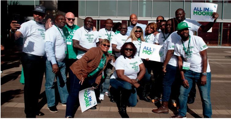
Pictured: AFSCME members pose together with Wes Moore, Democratic candidate for governor