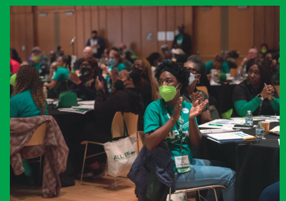
Pictured: Attendees in the Great Hall at the AFSCME Council 3 Convention

Check out photos from both days of Convention on our Facebook page! Go ahead and tag yourselves and your fellow members!