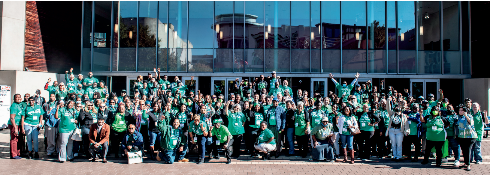
Pictured: Attendees of AFSCME Council 3's 5th Biennial Convention